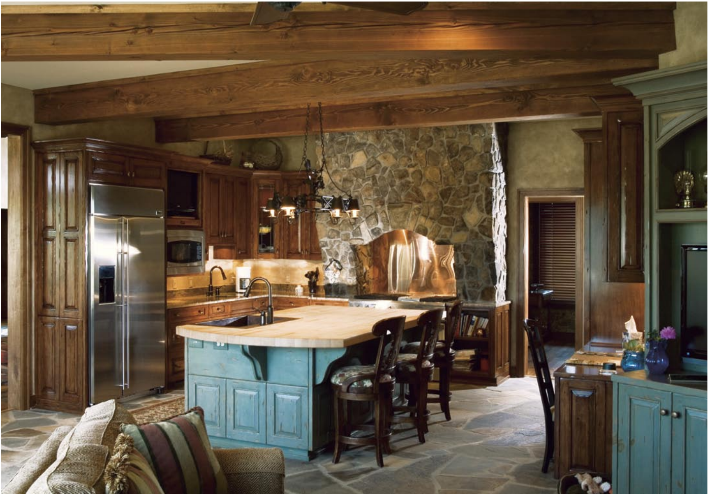
Right: The stonework by Hoots Stone Masonry blends perfectly with the solid cedar siding by Foothills Exteriors and the Eagle windows by Window & Door Concepts.

particularly significant, Edney said, because it has made such a mark in its long life. Built in 1937, the beautiful farm property served as the training center for the U.S. Olympic equestrian team in 1953. The property was remodeled in 1990, but the new owner wanted the property restored. So, Edney and his team took the house down to its exterior shell, preserving as much of the original wood as possible. Every room in the now 5,000-square-foot three-bedroom, four-bath home was reconfigured to modern standards. A timber-frame entrance greets guests, a gourmet kitchen with corian counters and restaurant-grade appliances replaced the dated kitchen, baths became spa retreats, about 1,000 heated square feet were added and the home was wired